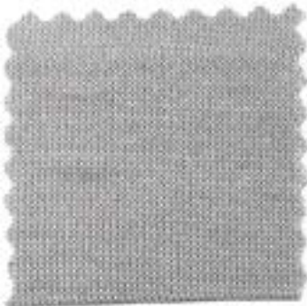
ICY Nm. 1/30 80% Viscose / 20% Polyamide(ACECOOL-BIO)