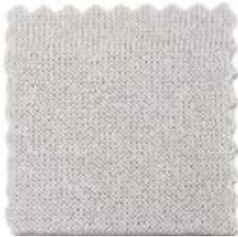
CAMEO Nm. 1/56 55% Cotton / 45% Polyamide(ACECOOL-BIO)