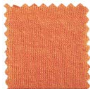
ELCANTO Nm. 1/27, 1/15 75% Linen / 25% Cotton 60% Cotton / 40% Linen