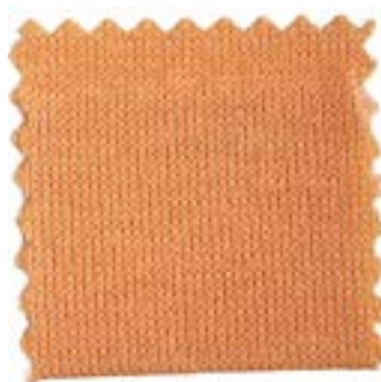
FORTE Nm. 2/48 70% Cotton / 20% Polyamide/ 10% Silk