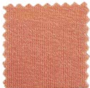
CLEVER Nm. 1/55 55% Cotton / 45% Acetate