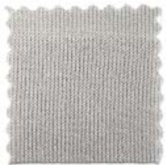
ALOE Nm. 2/48 93% Tencel / 7% Polyamide(ACECOOL-BIO)