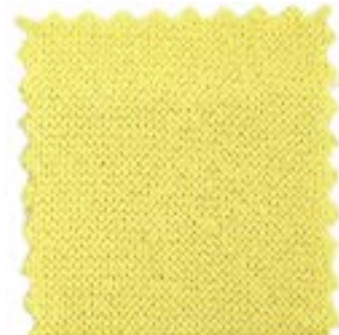
NATURE Nm. 1/24 65% Hanji(Paper) / 35% Polyamide