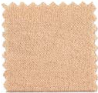
GLORY METAL Nm. 3/100 100% Cotton(Supima)