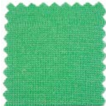
FAIRY Nm. 2/48 50% Merino Fine(RWS) / 50% Acetate(Recycled)

Using siro-fil process, its surface is clean and beautifully cover the wool. It contains wool's great benefits such as Hypoallergenic, Breathable, Regulating temperature, Odour resistance RWS certified Wool and Thermocool helps you keep comfortable during all season.