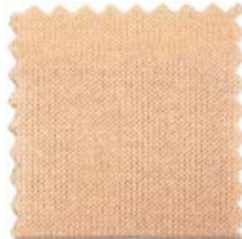
SAGE Nm. 2/60 80% Cotton / 20% Silk