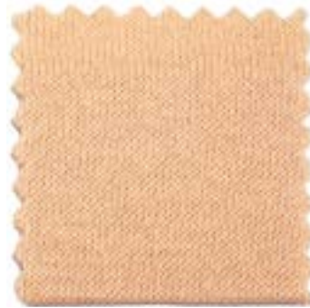
DIMPLE Nm. 2/60, 2/48 90% Cotton / 10% Cashmere