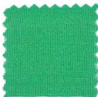
COOLDRY Nm. 1/55 55% Cotton/45% Polyester

Naia™ Renew is produced with the circular economy in mind, so you get quality products without compromising creativity or wasting our planet's resources.