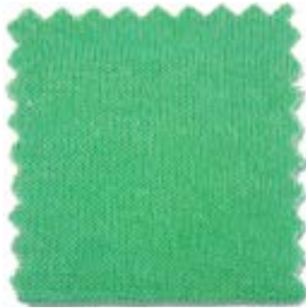
LEMONADE Nm. 1/60 45% Merino Fine(RWS) / 45% Thermocool / 10% Polyester