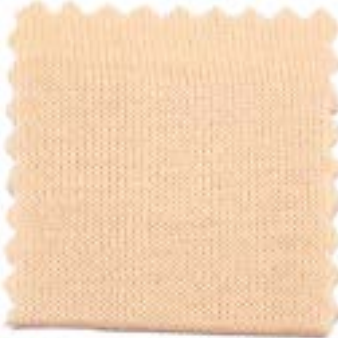
GLORY Nm. 3/100, 1/13, 1/5 100% Cotton(Supima)