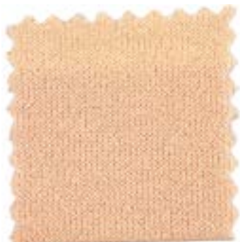
TOWER Nm. 1/26 85% Cotton(Supima) / 15% Elite(Dry touch)